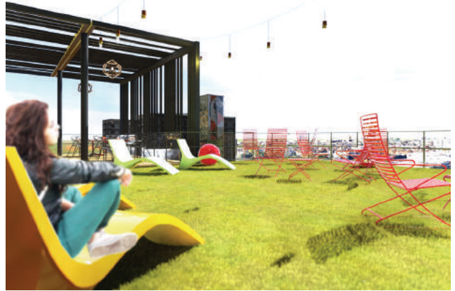
▼ ROOF DECK