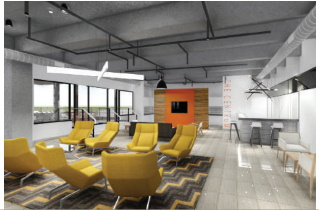
▲ TENANT LOUNGE

Highest Walk Score in Uptown! Surrounded by 22 Restaurants, 2 Hotels and it's only a 10 minute walk from Katy Trail.