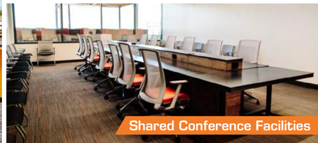
Shared Conference Facilities